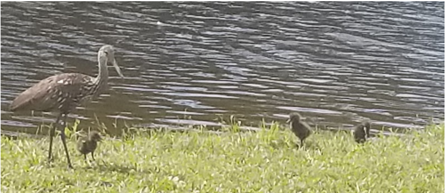
Limpkin Family by Pond